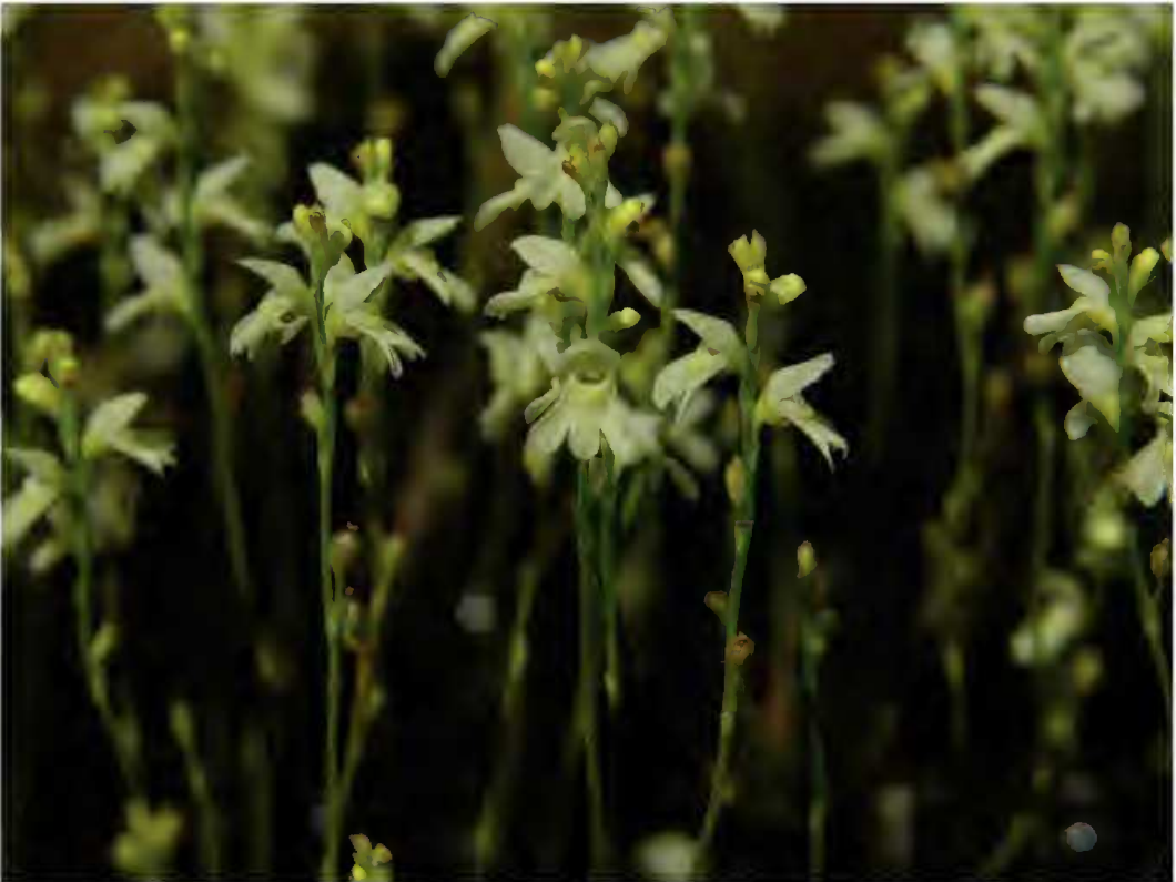
Figure 6: Flowers of U. neottiioides from Minas Gerais.